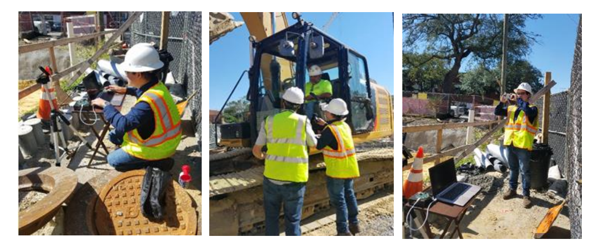
Figure 3: Setup process for audio collections using microphone array (left) and contact microphone (middle); Simultaneous video recording for generating the ground truth data (right).

Figure 4 illustrates the generated results for one sample machine, A CAT 320D Backhoe excavator, using a Zoom H1 digital handy recorder placed relatively close to the machine on the jobsite. The presented results are based on implementing SVM with linear kernel. The top part of the figure presents the normalized frequency for the machine's audio signal, while the middle and bottom parts show the actual (blue) versus predicted (black) activity labels and over the audio recording time period. As indicated in these figures, there is an excellent correlation between the actual and predicted results generated for the CAT backhoe excavator.